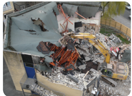
Top: How the new College building will look Bottom: Demolition begins